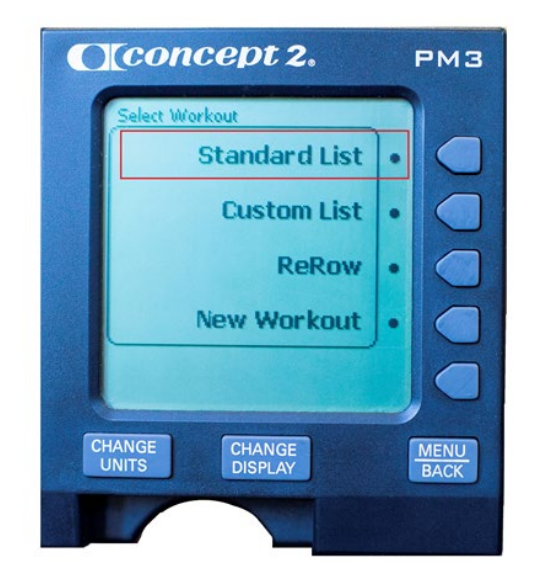
Figure 2-2.--"Select Workout" Page. Press "Standard List"