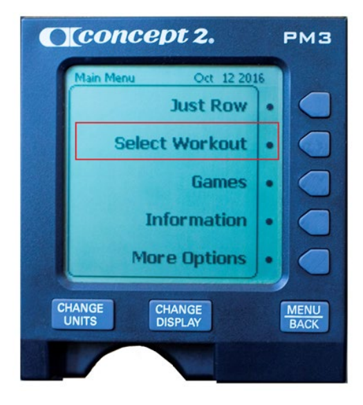
Figure 2-1.--"Main Menu" Page. Press "Select Workout"