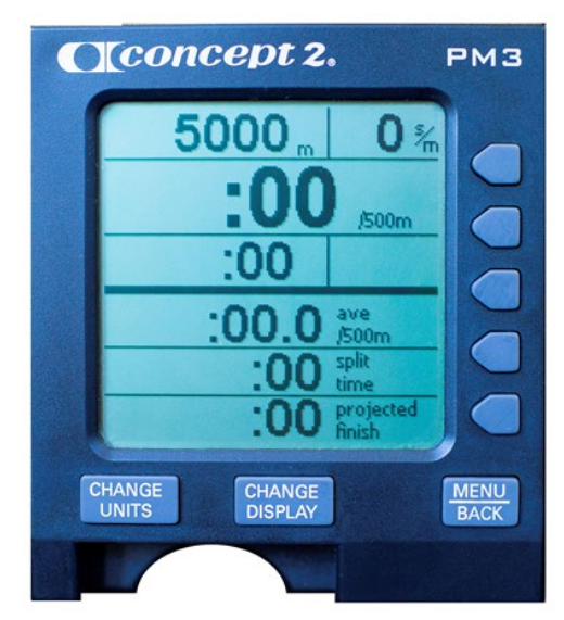
Figure 2-4.--"5000m" Test Page. 5,000m "Start" Screen

(d) The event begins when the FFI or CPTR gives the command "Begin". Time starts automatically on the rowing monitor display when the Marine starts rowing. The rowing distance display counts down from "5000m" to "0". The test ends when the Marine reaches zero meters, or stops rowing for a period long enough that the monitor turns off. The rowing time will be rounded up or down to the nearest whole second (e.g., 22 minutes, 8.6 seconds will be recorded as 22 minutes, 9 seconds. 22 mins, 8.5 seconds will be recorded as 22 minutes, 8 seconds).