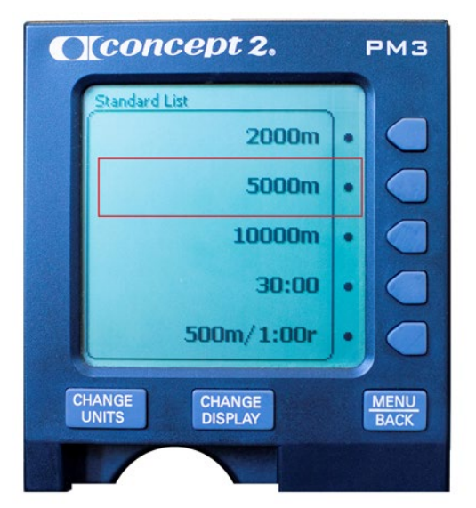
Figure 2-3.--"Standard List" Page. Press "5,000m"