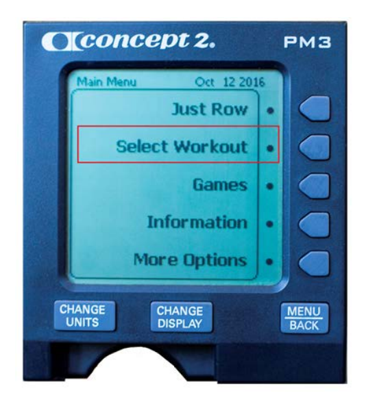
Figure 2-1.--"Main Menu" Page. Press "Select Workout"