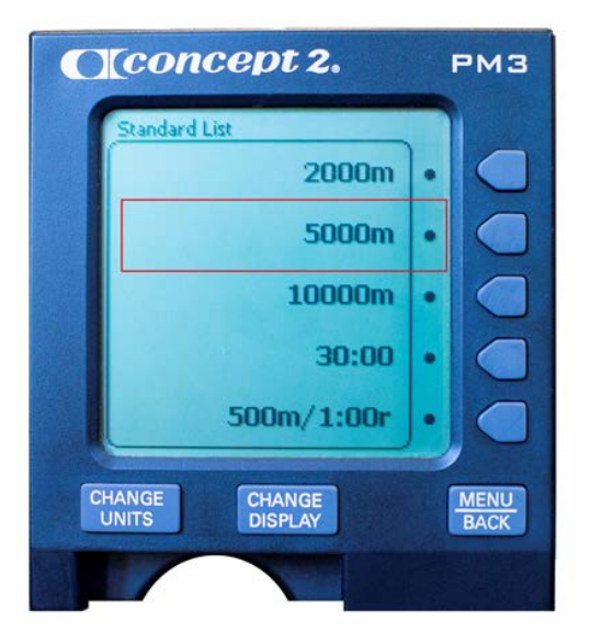
Figure 2-3.--"Standard List" Page. Press "5,000m"