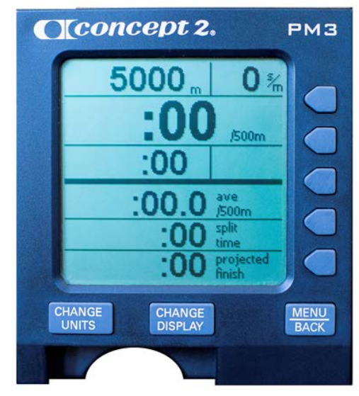
Figure 2-4.--"5000m" Test Page. 5,000m "Start" Screen