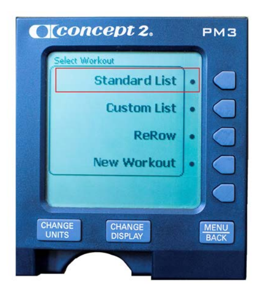
Figure 2-2.--"Select Workout" Page. Press "Standard List"